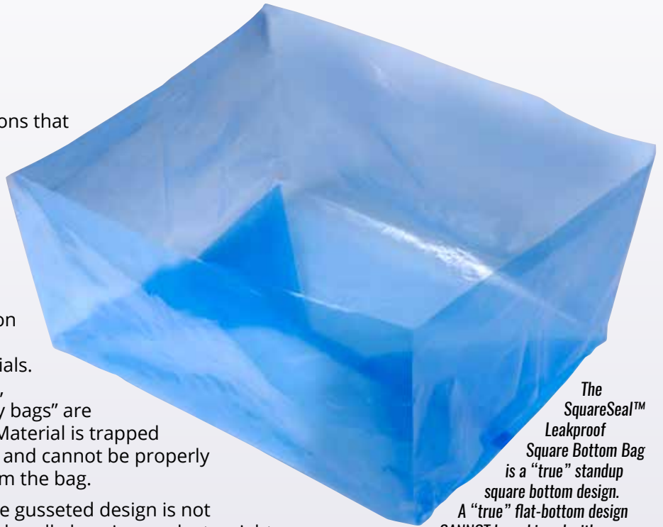
The SquareSeal™ Leakproof Square Bottom Bag is a "true" standup square bottom design. A "true" flat-bottom design CANNOT be achieved with a gusseted bag.