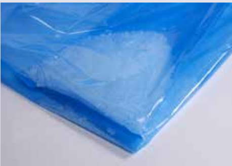
With gusseted design poly bags, material cannot be evacuated properly. Trapped material typically results in 1-2% raw material loss.

Polymer Packaging has created a new proprietary design solving the issues with gusseted poly bags with the introduction of SquareSeal™ Leakproof Square Bottom Bags.