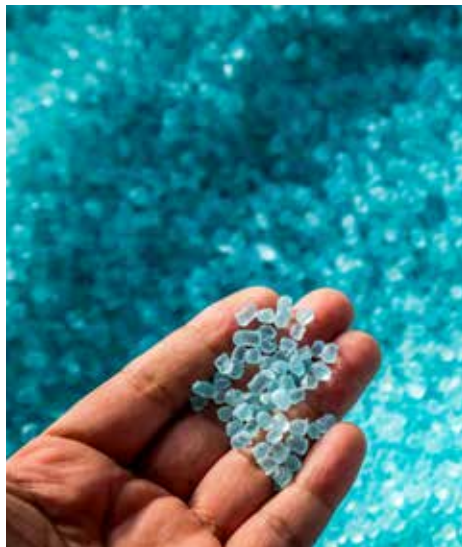
Industrial/Pharmaceutical companies cannot afford to waste precious raw materials.