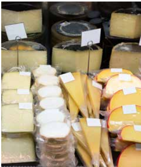
Perfect for processing food products where extraction is difficult.

Cheese Jellies/Jams Sauces High-Value Spreads Pharmaceutical/ Honey Industrial Material